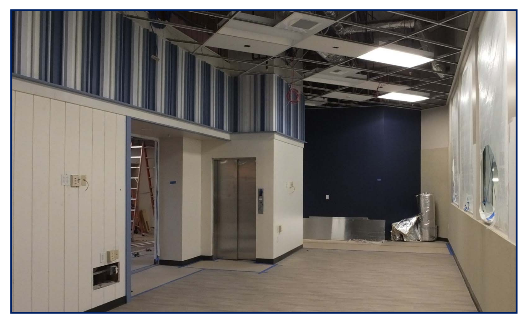
Cherrywood FIS – Front FIS Space Looking East