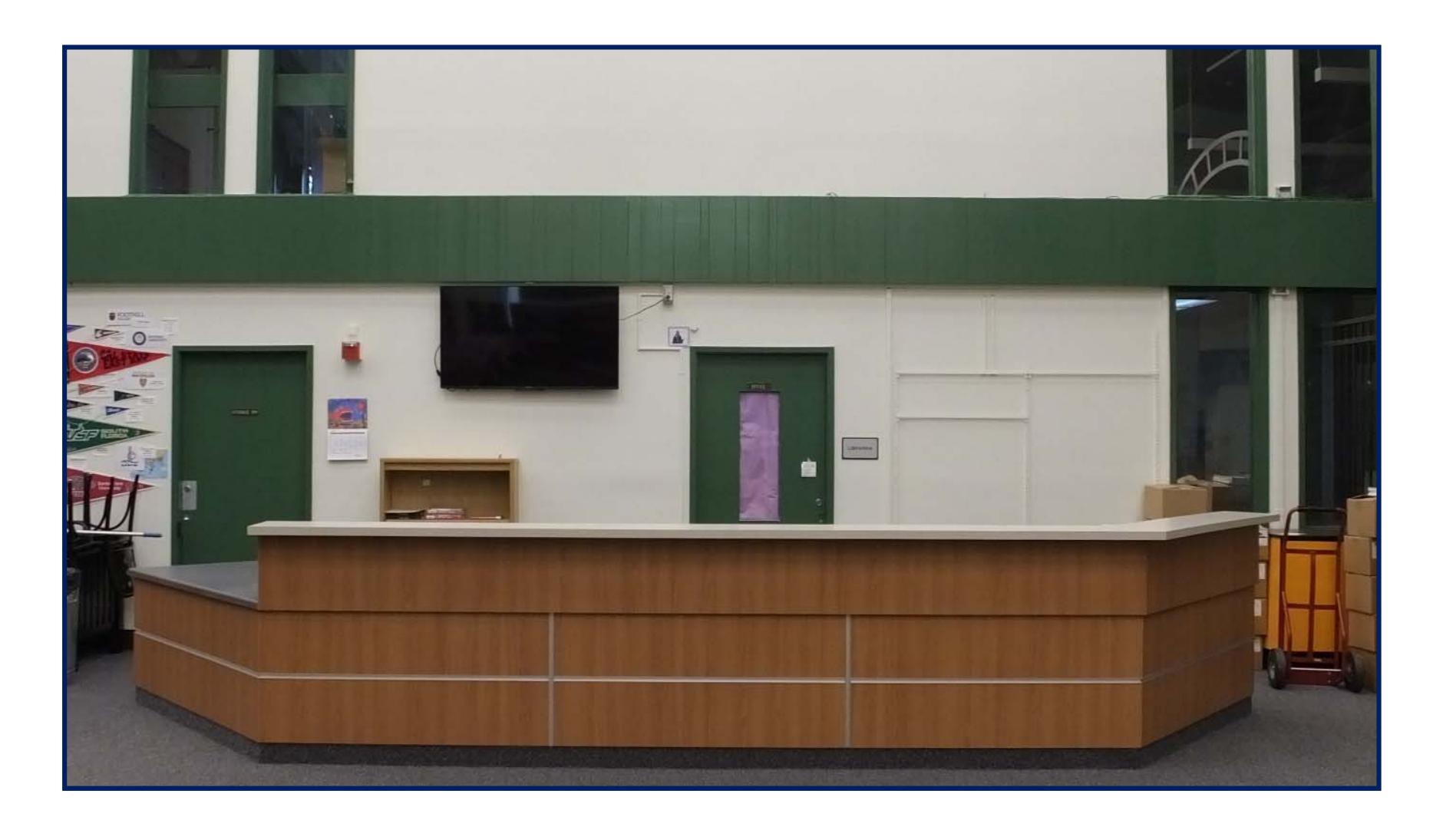
Morrill Library Desk