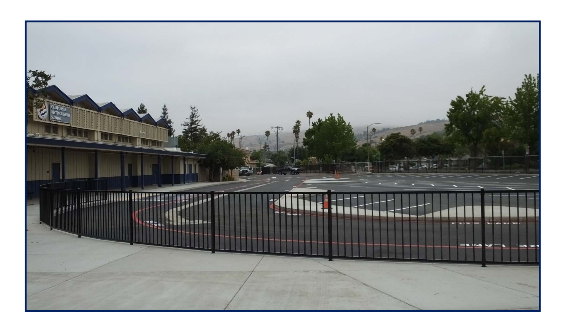
Piedmont Parking Lot