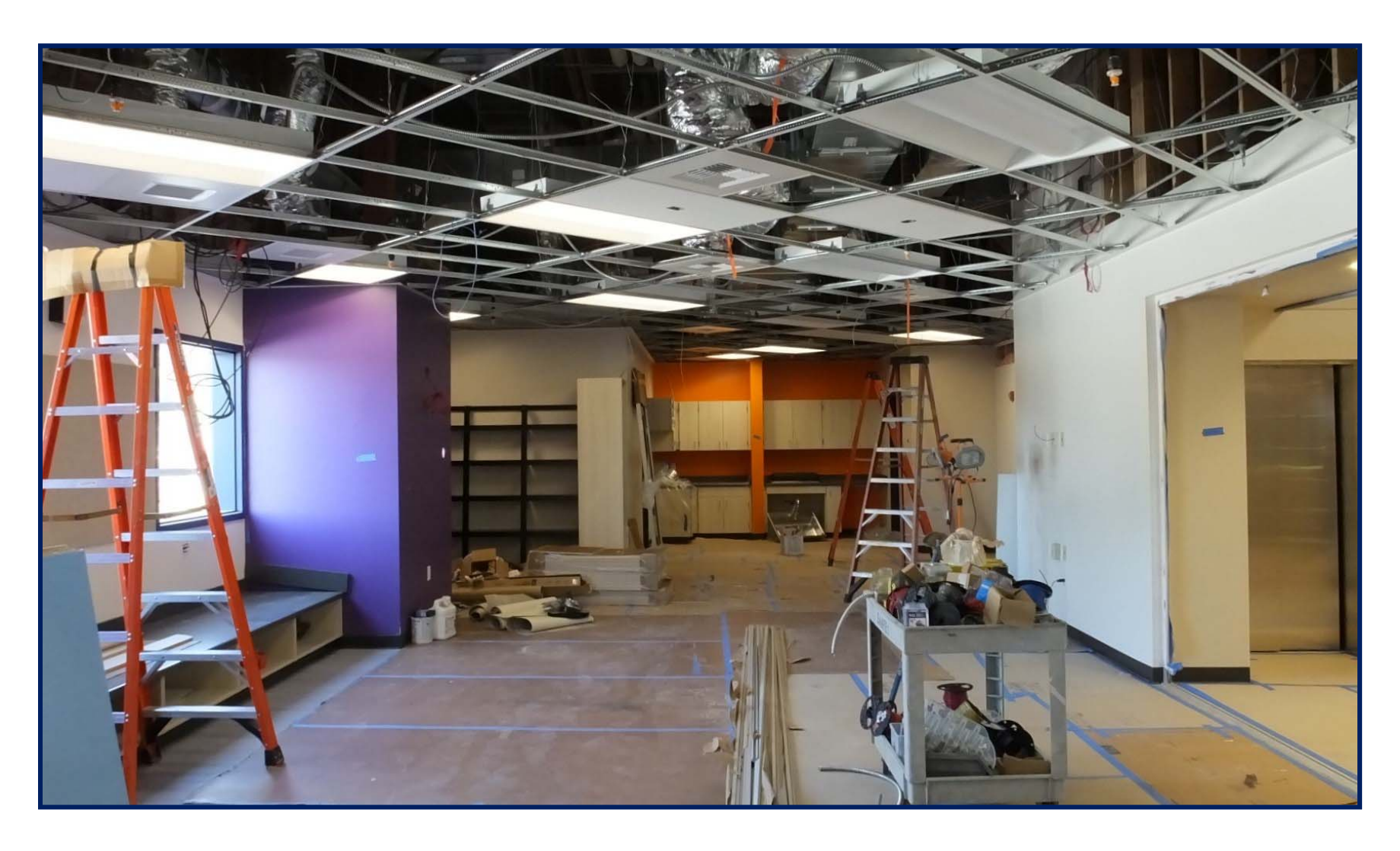
Cherrywood FIS – FIS Space Looking East